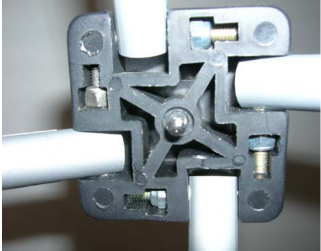
C/E hubs have crossbars nut and bolted.