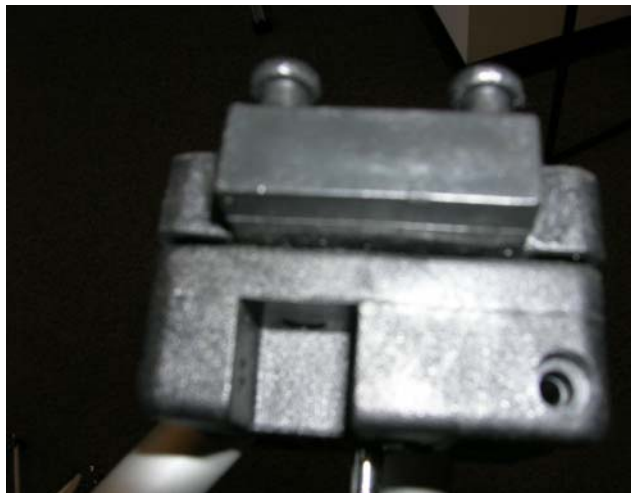
B/D pins have no insert.