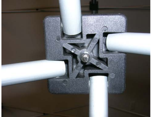
B/D hubs have crossbars screwed into hub.