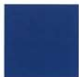
ROYAL BLUE pms 281