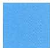
COLUMBIA BLUE pms 542