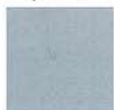
GREY pms 423