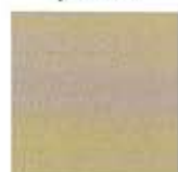
GOLD METALLIC pms 873

WASHING INSTRUCTIONS: Machine Wash 160°F - Use synthetic detergents. Do not use soap, bleach or softeners which might adversely affect the flames retardant qualities of the fabric. TUMBLE DRY 140°F - Remove immediately. 100% POLYESTER - Excessive heat, loading and leaving too long in extractor or dryer will detract from permanent press characteristics of all polyester fabrics. IRONING - If above instructions are followed, no ironing required. If necessary, light touch up with hand iron at 250°F setting, DO NOT MANGLE.