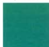
KELLY GREEN pms 348