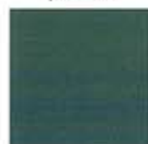
DARK GREEN pms 5535