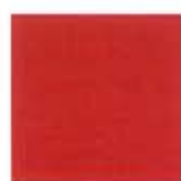
SCARLET pms 1805