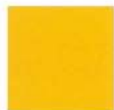
LIGHT GOLD pms 1235