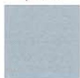
SILVER METALLIC pms 877