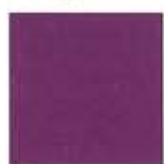
DARK MAROON pms 5115