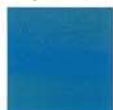
TEAL pms 315