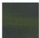
BROWN pms black 4