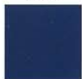
NAVY BLUE pms 2767