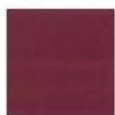
CARDINAL pms 195