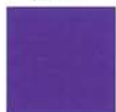
PURPLE pms 276