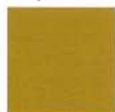
OLD GOLD pms 1255